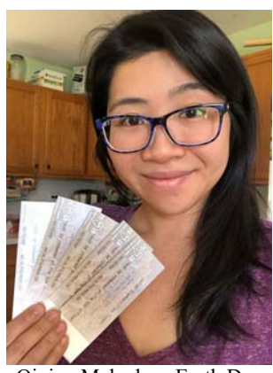
Oiying Malcolm - Earth Day Passport Winner shown holding a green prize

Gift giving can be a challenge anytime but it may seem more difficult during a global pandemic. Please know that the green basics haven't changed, gift cards for local business services are still high on the list of supporting our community and giving something that can be tailored to the individuals on your list. When purchasing an item, try to find one with recycled content either in it, such as some shoe and backpack and coat brands; or be sure the packaging is made with recycled content and the item is durable. Do your best to make sure it is desired, otherwise, the thought may be appreciated but the item could still go to waste. While sports and theatrical entertainment may not be offered now, we know they will return and gift certificates to those could genuinely help these organizations during this rough season, while also giving the gift of anticipation to your friend.