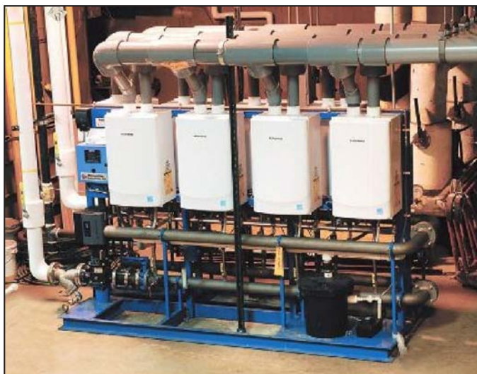
Pictured is a prefabricated domestic heating system skid consisting of eight 98% efficient Navien tankless water heaters, a variable speed supply pump that circulates domestic water from the domestic storage tank to the heaters, a control system and all the necessary piping & valves manufactured by Metropolitan Industries Inc. for Sunny Hill Nursing Home.

Metropolitan’s solution was designing a heating system that can directly heat the domestic water more efficiently and allow the maintenance staff to shut down their existing boiler plant in the warmer months. Metropolitan supplied a skid-