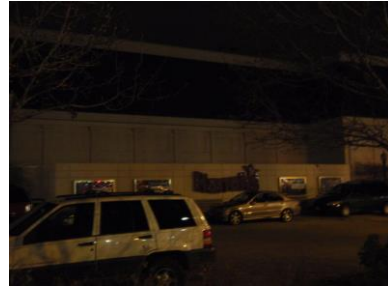
Harrah's in Joliet during Earth Hour 2011

The last Saturday of March, 8:30pm to 9:30pm has been recognized as Earth Hour since 2007 when 2.2 million residents of Sydney, Australia participated by turning off all non-essential lights. The event went global as a way for homes and businesses to raise awareness of the amount of energy we use. Earth Hour 2012 will take place on March 31, 2012 from 8:30p.m. to 9:30p.m., at each participant's local time.