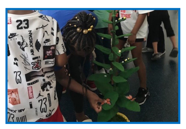
Kids over the summer at the Downtown Joliet Public Library experiencing handson Monarch butterflies and milkweed.