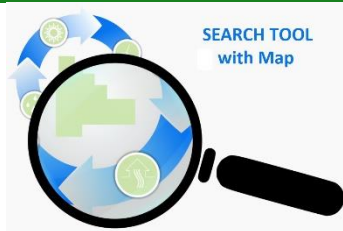
Search for recycling and disposal options on willcountygreen.com