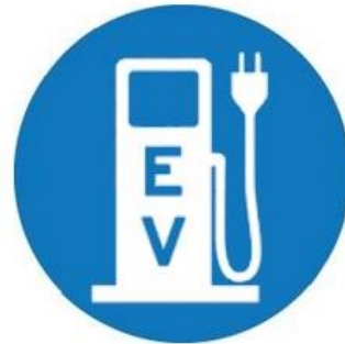
Info on Electric Vehicles