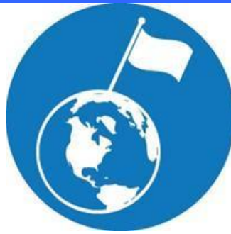
School Earth Flag