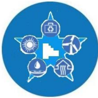
Green Business Star