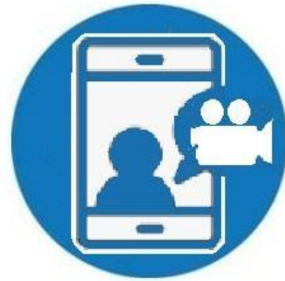
Take a Virtual Tour