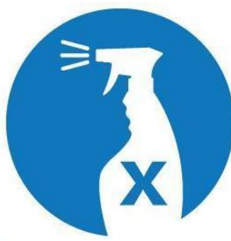
Household Hazardous Waste Drop-Offs