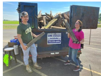
Volunteers at past events