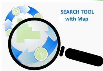
Search for recycling and disposal options on willcountygreen.com