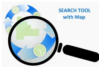
Search for recycling and disposal options on willcountygreen.com