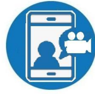
Take a Virtual Tour