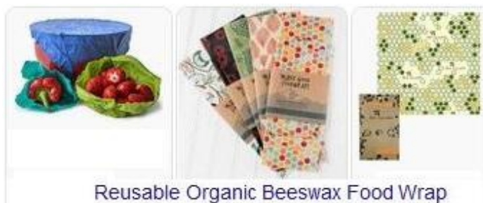
Reusable Organic Beeswax Food Wrap

Instead of covering food with stretch plastic film or aluminum foil, consider purchasing some reusable, all natural wrap made with beeswax. This safely stores a variety of fresh food and covers bowls or plates of food without creating waste.