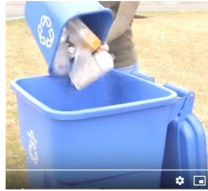
Recycling Can Be Easy, If You Do It Right

A statewide group was formed in 2018 in response to China blocking recyclable materials from their ports. The country didn't want trash being processed there and our recycling wasn't becoming increasingly contaminated. The Illinois Recycling Contamination Task Force group created a video to remind residents of the recycling basics and let everyone know that recycling is still working in Illinois. Take a minute to watch! Share on your social media or tell your friends. Together we can improve curbside recycling and make certain there is demand for our valuable resources!