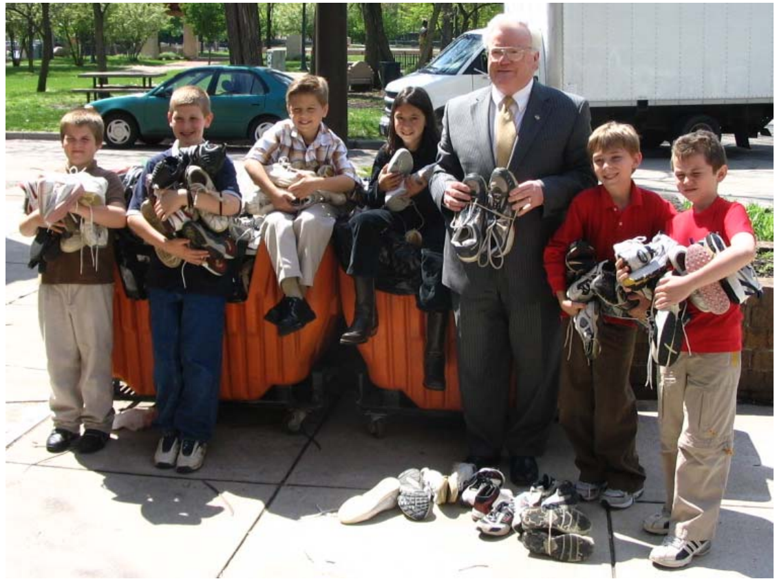
May 2, 2006 – 1<sup>st</sup> Will County Athletic Shoe Collection