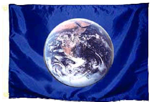
A replica of an Earth Flag awarded schools.

teachers across the county. Will County, with the support of the Illinois Department of Commerce and Economic Opportunity, awarded Earth Flags to the schools listed below for receiving educational presentations to one grade level of students and successfully reducing and recycling waste in their buildings.