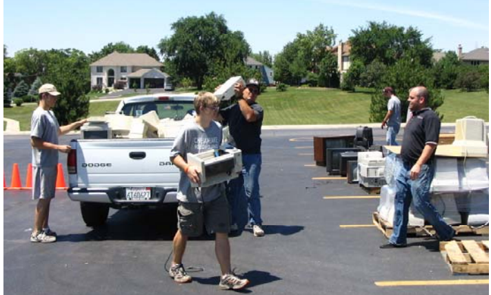
Above - Residents unloading their vehicle with assistance from the County's Contractor, Chesapeake

trailer was filled with surplus electronics from County offices. Nearly 350 vehicles came to the event. Frankfort, Joliet and New Lenox had the highest participation rates. A total of 63,128 pounds or 31.6 tons of consumer electronics were collected. This event was paid for by Waste Management through the County's landfill contract.