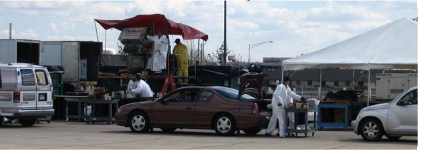
Workers unloading household hazardous waste brought to a collection event.

throughout Will County (the locations are noted in the summary chart on the following page). Waste Management, Inc. reimbursed the County for two of the events through the County's landfill contract. The cost per event averaged $22,399 and cost per participant averaged $41.10, while the amount per participant averaged 90.65 pounds.