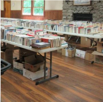
Pilcher Park Nature Center 2501 Highland Park Dr. Joliet June 4,5,6 Fri, Sat, Sun 9am-4pm

Will County is proud to announce the return of our annual Book ReUse and Recycling event at its normal scheduled weekend, in its usual location! With over 50% of Illinois adults vaccinated, we were approved to offer this precious three-day book lovers dream event. Residents are welcome to drop-off boxes and take bags of books, appropriate for all ages. We are offering assistance with unloading but encourage everyone to park and visit the tables under the tent, on the outside deck and inside the Nature Center. Participants must wear masks and socially distance to "shop" the event. Hundreds of books are being donated by libraries and schools and any books not taken will be donated or recycled depending on requests from non-profits.