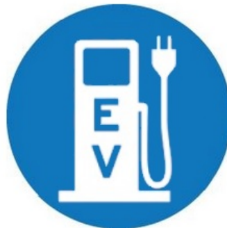
Info on Electric Vehicles