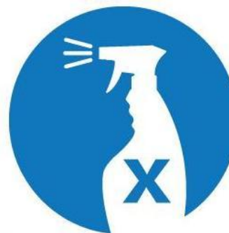
Household Hazardous Waste Drop-Offs