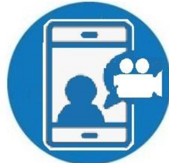
Take a Virtual Tour