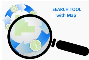
Search for recycling and disposal options on willcountygreen.com