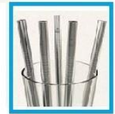
Metal Straw (washable)