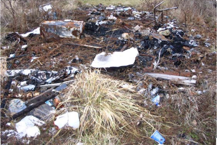
Above – Photos of an illegal dump site. Waste Services issued a "Non-Compliance Notice" in the summer of 2005. After repeat inspections and verbal commitment to clean-up the site, a December 2005 inspection revealed the open-dumped waste had been burned. A "Violation Notice" was issued and legal action (which can include fines and penalties) began to be pursued.