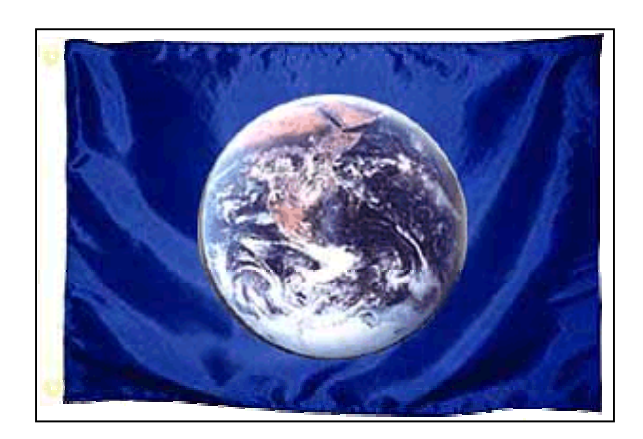
A replica of an Earth Flag awarded to the following schools.

The majority of educational efforts in 2005 were directed towards schools. In 2005, the Waste Services Staff presented information to 7,880 children and teachers across the county. Will County, with the support of the Illinois Department of Commerce and Economic Opportunity, awarded Earth Flags to the schools listed below for receiving educational presentations to one grade level of students and successfully reducing and recycling waste in their buildings.