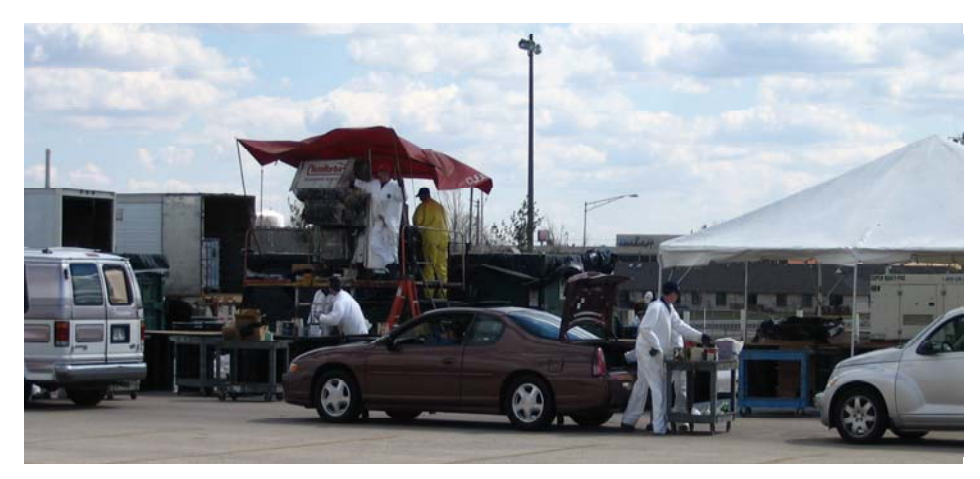
Workers unloading household hazardous waste brought to a collection event.

throughout Will County (the locations are noted in the summary chart on the following page). Two of the events were funded by the Illinois EPA and two were provided by Waste Management, Inc. through the county's landfill contract. The cost per event averaged $22,299 and participant cost per averaged $46.67, while amount per participant averaged 57 pounds.