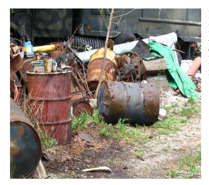
Above – An example of "illegal dumping" of scrap metals, barrels, and potentially pollution causing liquid materials.