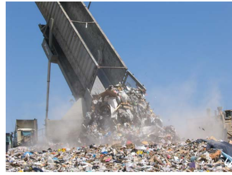
Above – A load of waste from a transfer trailer being dumped at the Prairie View Recycling and Disposal Facility.

Through the landfill operating agreement, the facility generated almost $1.275 million for the