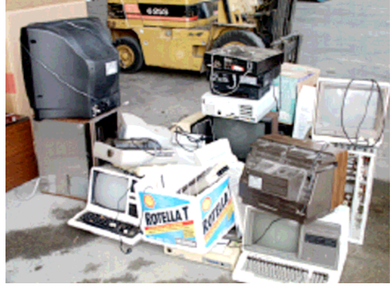
Right – Various types of equipment collected at a consumer electronics event.