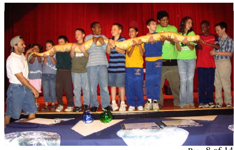
Page 8 of 14