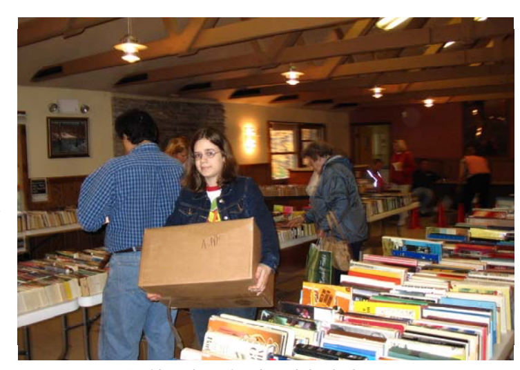
Residents browsing through books for reuse at the annual 3-day book collection event.

Residents, schools, libraries and businesses brought their "gently used" books to be given away for reuse or recycling at the event. As books were brought in, the Land Use Department staff and several student volunteers